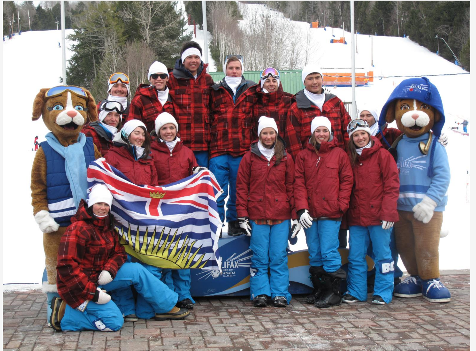
Coached BC Team 2009-2011