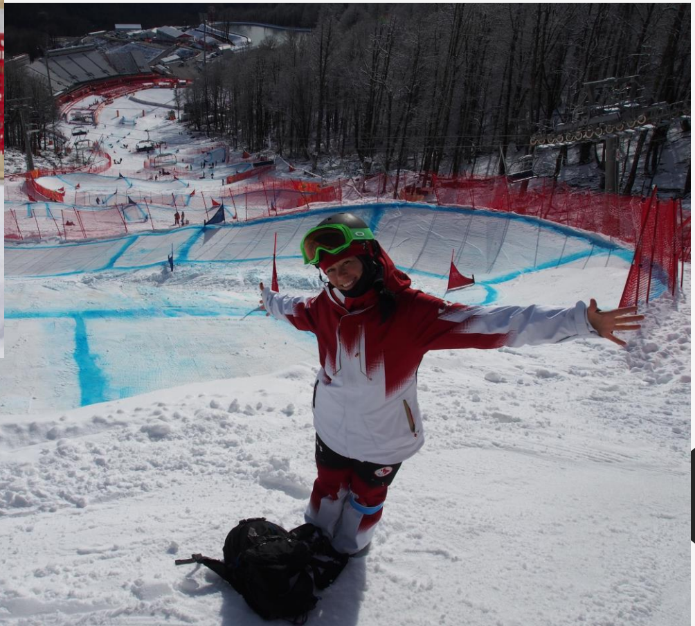
2014 Winter Paralympic Games. Sochi, Russia