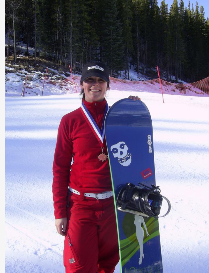
Snowboard Athlete: 1994- 2005