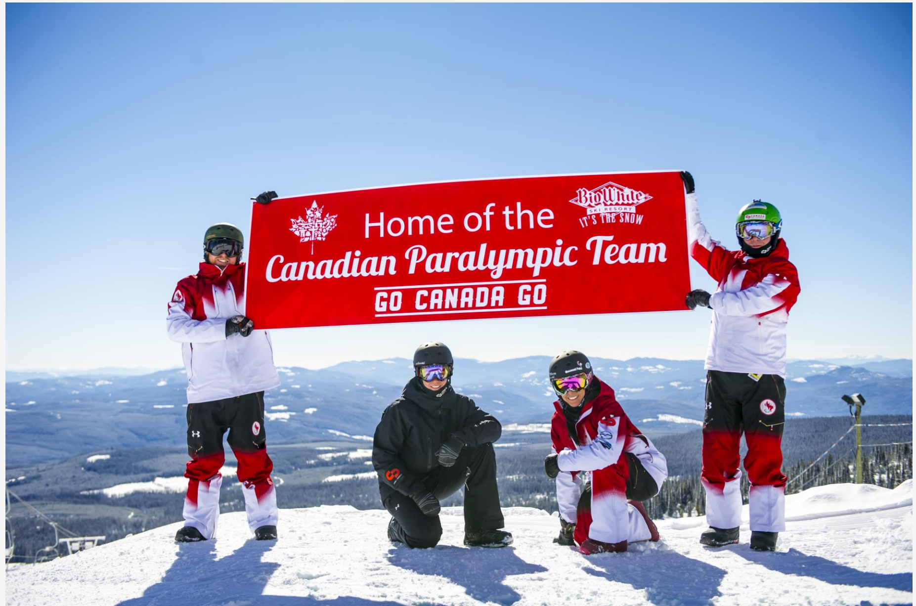
Para Team moved to Big White leading up to Sochi