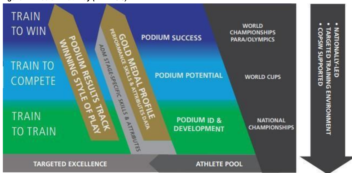
Figure 1 – Podium Pathway (LTAD 3.0)

Canadian Sport Institute / PacificSport athlete and coach support for the Canadian Development and Provincial Development nomination focuses on athletes and teams 5-12 years from the international podium, identified by the sport-specific Podium Pathway (see Figure 1 below) and Gold Medal Profile. These athletes and teams represent both the next generation (5-8 years away) and future generations (9- 12 years away) of Olympic and Paralympic (or World Championship) medalists. Support may be focused more toward the future generation (9-12 years away) for some targeted Paralympic sports depending on the quality of the next generation (5-8 years away) of athletes and teams.