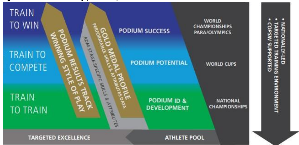
Figure 1 – Podium Pathway (LTAD 3.0)

Canadian Sport Institute / PacificSport athlete and coach support for the Canadian Development and Provincial Development nomination focuses on athletes and teams 5-12 years from the international podium, identified by the sport-specific Podium Pathway (see Figure 1 below) and Gold Medal Profile. These athletes and teams represent both the next generation (5-8 years away) and future generations (9-12 years away) of Olympic and Paralympic (or World Championship) medallists. Support may be focussed more toward the future generation (9-12 years away) for some targeted Paralympic sports depending on the quality of the next generation (5-8 years away) of athletes and teams.