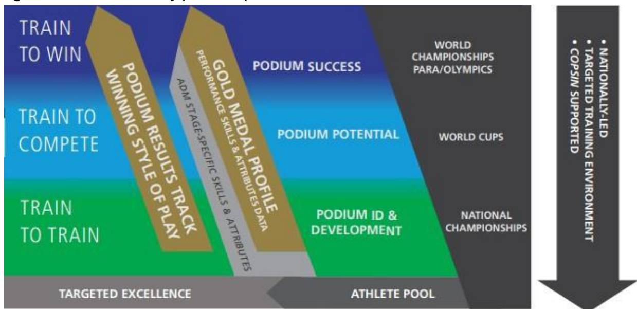
Figure 1 – Podium Pathway (LTAD 3.0)

Canadian Sport Institute / PacificSport athlete and coach support for the Canadian Development and Provincial Development nomination focuses on athletes and teams 5-12 years from the international podium, identified by the sport-specific Podium Pathway (see Figure 1 below) and Gold Medal Profile. These athletes and teams represent both the next generation (5-8 years away) and future generations (9-12 years away) of Olympic and Paralympic (or World Championship) medalists. Support may be focused more toward the future generation (9-12 years away) for some targeted Paralympic sports depending on the quality of the next generation (5-8 years away) of athletes and teams.