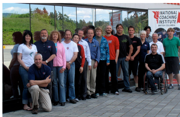
International Coaching School 2011

The annual Wine and Cheese evening reception was attended by over 80 people, including the Honourable Ida Chong, Minister of Community, Sport and Cultural Development, and featured a keynote by Wendy Pattenden, CSC Pacific CEO, on the Future of High Performance Sport in Canada. The key theme of the evening was recognition and celebration of the integral role coaches play in the success of Canadian sport from 'playground to podium'.