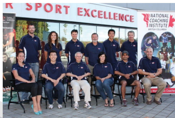
NCI Diploma coaches